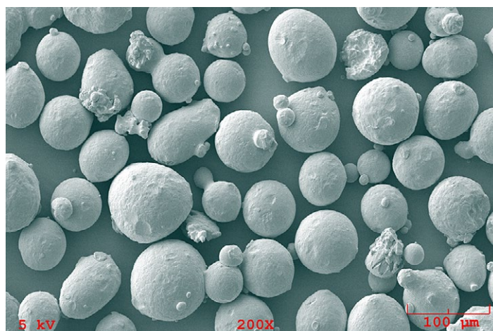
Mechanically Clad (top), Gas Atomized (bottom)